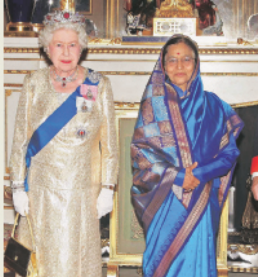
Presidential start: Queen Elizabeth II with President Pratibha Patil in London on Wednesday. The President will kick off the relay. The Indian baton bearers contingent includes boxer Vijender Singh, former hockey captain Dilip Tirkey, tennis player Sania Mirza, former athlete Milkha Singh and Prakash Padukone.

1,70,000 km. Six continents. 71 countries. The 2010 Queen's Baton Relay (the Commonwealth Games' equivalent of the Olympic torch) kicks off at Buckingham Palace in London on Thursday. Queen Elizabeth II will pass the specially designed baton (extreme right) to President Pratibha Patil, who will then pass it to Indian Olympic Association (IOA) chairman Suresh Kalmadi who, in turn, will pass it on to shooter Abhinav Bindra, who will start the rally. The 2010 edition of the relay, a tradition that dates back to the 1958 games at Cardiff, has the longest and most elaborate relay route in Commonwealth Games history. It will pass through the remotest places in the commonwealth—the island of St Helena off the west coast of Africa, accessible only by boat—and use every means of transport available—bicycles, hot-air balloons, steam trains, even elephants. It will travel to all the Commonwealth nations before entering India through the Wagah border on 25 June. It will then start a 100-day sojourn through the country, through every state and state capital, before entering Delhi on the eve of the Games.