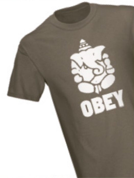
▲ We Still Holding On: The Doers, thedoers.blogspot.com , Rs300.