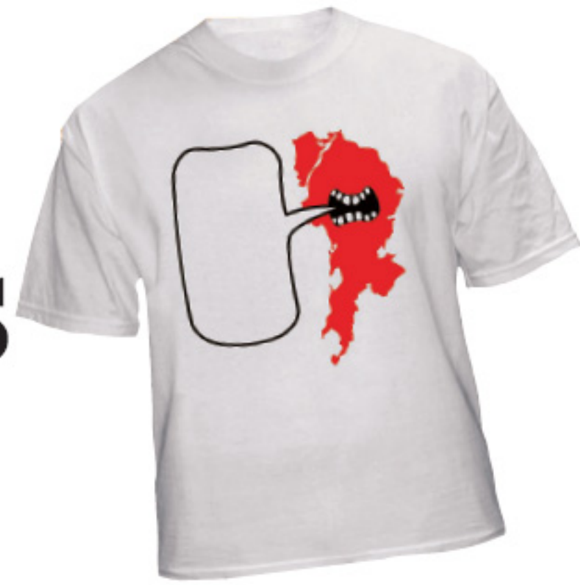
▲ Speak Mumbai Speak: Fill in your own quote, by The Doers, thedoers.blogspot.com , Rs300.