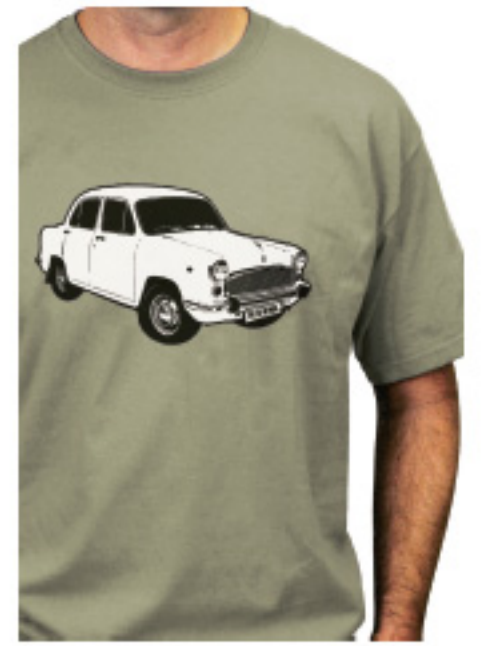
▲ Ambassador: by Desi Rage, www.desirage.com , $22.99 (around Rs1,140).