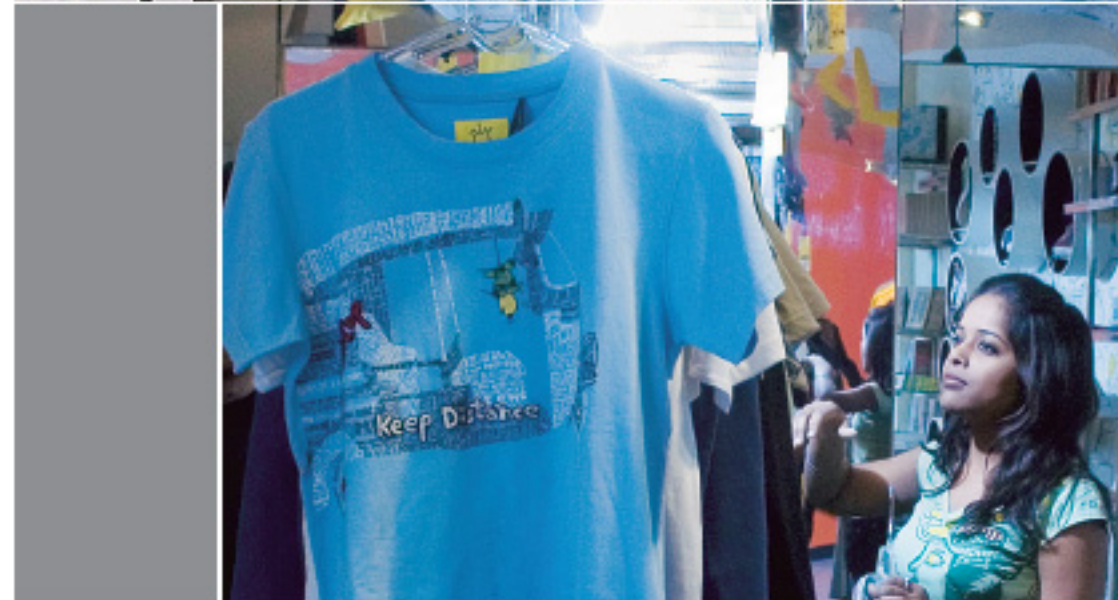
◀ Auto Risk Shah: at Play Clan, Select Citywalk mall, Saket, New Delhi, Rs785.